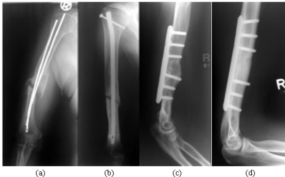
Fig 2: Pre-and postoperative X-rays. Pseudarthrosis with Ender-Nails (a), intramedullary Nail (b). Stabilisation each with angular stable internal fixator(c+d)

with several authors (Jupiter and Von Deck, 1998; McKee et al. , 1996; Lin et al. , 2000; Ring et al. , 1999, 2000). In our study, we compare results of the therapy of humeral non-unions with dynamic compression plate to those with an multidirectional angular stable internal plate fixator. Both implants can lead to bony consolidation,