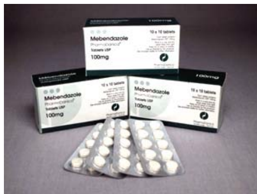
Fig. 3: Mebendazole; http://www.stanford.edu/class/humbiol103/ParaSites2006/Enterobius/