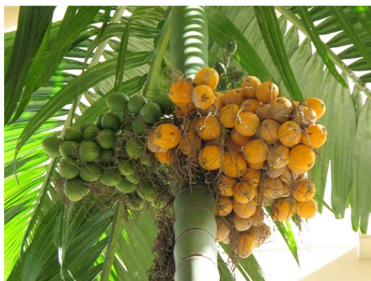
Fig. 2: Areca catechu Linn; http://floraofsingapore.wordpress.com