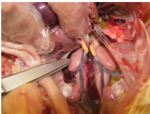
Fig. 1: Urates deposition and kidney lobules necrosis in broiler bird affected by gout (treatment group)

*Two different letters in a column show meaningful statistical difference between two groups ( p < 0.05 )