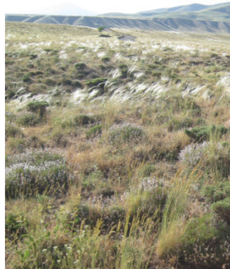
Fig. 1: Part of Shanjan rangeland in Shabestar district, East Azerbaijan province, Iran

in the availability of safe micro-sites for plant re-establishment (Oosterheld and Sala, 1990) and the invasion of woody plants (Milchunas and Lauenroth, 1993; Rodriguez et al. , 2007; Schlesinger et al. , 1990). Above-ground defoliation can modify the partitioning of assimilates between below- and above-ground organs and consequently the root growth of defoliated plants (Belsky, 1986; Richards and Caldwell, 1985; Rodriguez et al. , 2007; Snyder and Williams, 2003). In this research, we have studied the amount of above ground biomass and occurrence of Chenopodium album (Gharaman, 2003) (Fig. 1) at the rangeland area of Shanjan