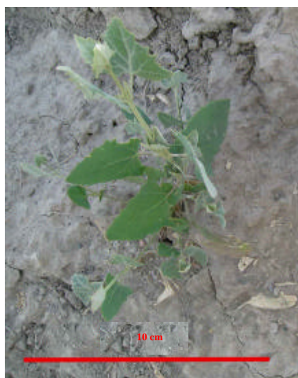
Fig. 2: Chenopodium album species