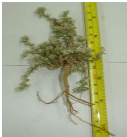
Fig. 1: Paronychia kurdica species

method. In simple accidental sampling method each people has equal for selecting (Farahvash, 2004). In this sampling determined accidental vegetal coverage and or un-coverage in each plot. The researchers determined geographical direction and elevation for each plot. Sampling is done from early May to late July and it ended late June when 60% of area coverage was in blossoming stage. Most of the plots were used from above statistical method in this season. And all of the present plants in plots after plant sampling were measured in two parts separately. Sampling from area studding plants after sending to laboratories each plant was photographed to record general above ground and below ground morphology/architecture prior to being dissected into its component parts to determine biomass. Above ground biomass was measured by separating the foliage, branches and stem. Each component was oven dried at 80°C for 24 h then weighed. Below-ground biomass was determined by hosing roots clean of soil, before they were oven dried at 80°C for 24 h then weighed. The dry weight of each plant component was recorded to the nearest 0.1 g and statistical analyzing is done by Excel.