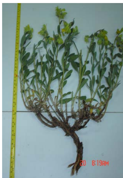
Fig. 1: Anchusa italica species

determined by hosing roots clean of soil before they were oven dried at 80°C for 24 h then weighed. The dry weight of each plant component was recorded to the nearest 0.1 g and statistical analyzing is done by Excel.