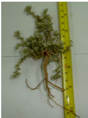
Fig. 1: Paronychia kurdica species

Sampling from area studying plants after sending to laboratories. Each plant was photographed to record general above-ground and below ground morphology/architecture prior to being dissected into its component parts to determine biomass. Above ground biomass was measured by separating the foliage, branches and stem. Each component was oven dried at 80°C for 24 h then weighed. Below ground biomass was determined by hosing roots clean of soil before, they were oven dried at 80°C for 24 h then weighed. The dry weight of each plant component was recorded to the nearest 0.1 g and statistical analysis is done by Excel.