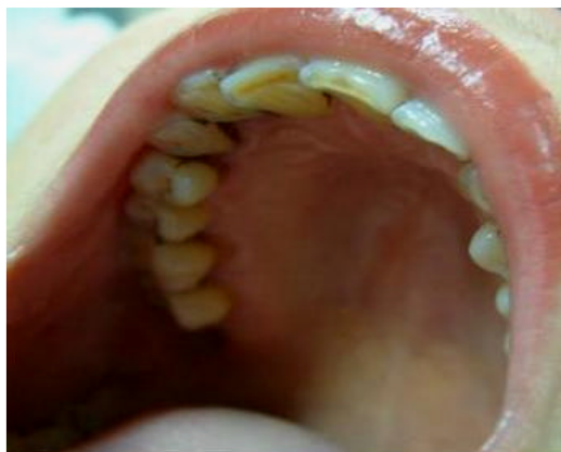
Fig. 2: Papilloma after treatment

The aim of this study was to evaluate effectiveness of cryotherapy on treatment of squamous papilloma and fibroma. Results of this study showed that 85% of lesions were treated 1 week after treatment and 10% after 2 weeks.