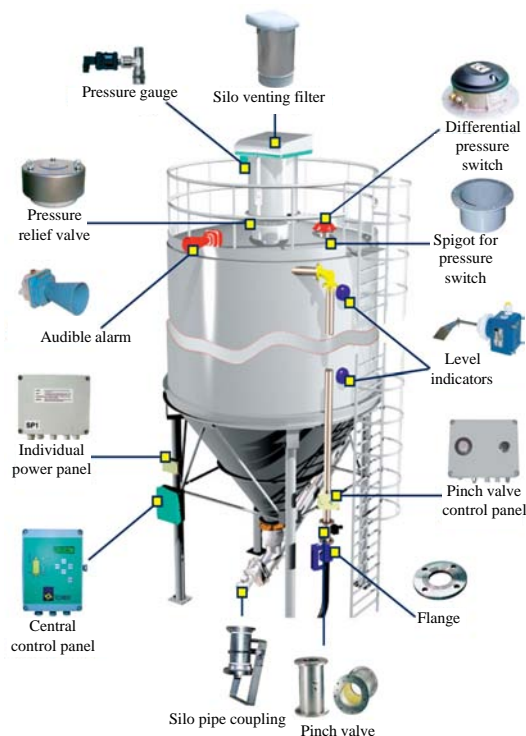
Fig. 2: Cement Silo safety system

Reveals presence of compressed air to venting filter (if air jet filter is used) and pinch valve. CSSS can be used for Silos which are filled with powders or granular materials by tanker. Damage to the Silo or its accessories