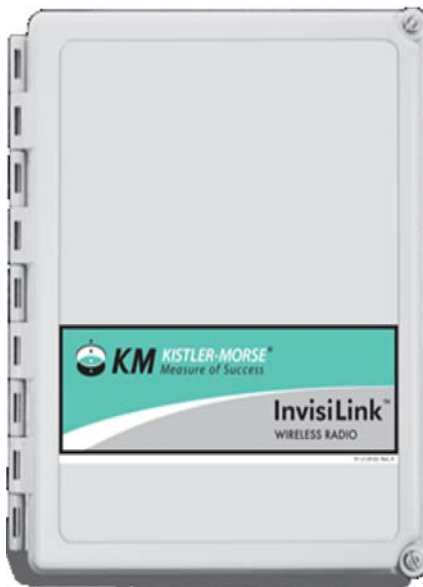
Fig. 5: InvisiLink wireless radio

The data exchange is carried out by InvisiLink wireless radio (Fig. 5) which eliminates the need for cables and cable connections between sensors and data acquisition devices. InvisiLink wireless radio interacts using radio frequencies using RS-422 or 485 protocols and can be configured as single-point or multi-point.