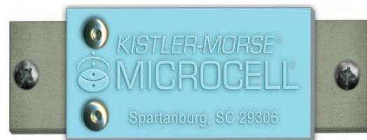
Fig. 3: Microcell bolt-on sensor

Electrical signals from microcell bolt-on sensor are transmitted to SVS2000 controller (Fig. 4). The