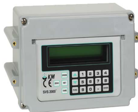
Fig. 4: SVS2000 controller