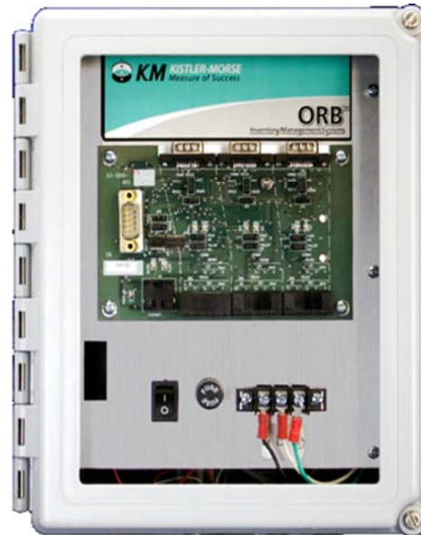
Fig. 6: ORB inventory management system

ORB inventory management system maintains constant monitoring of technical condition and warns