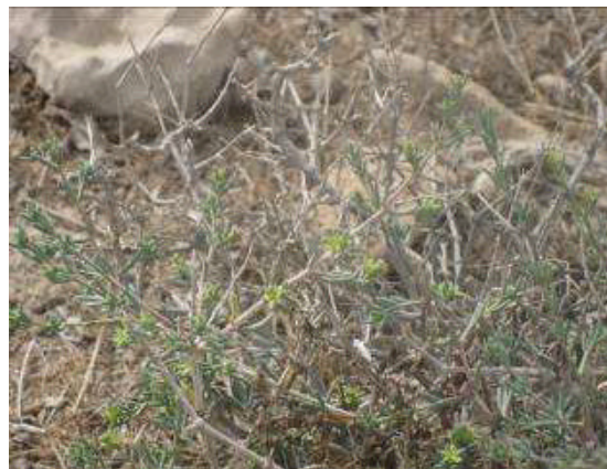
Fig. 1: Image of G. decander species

Characteristics of G. decander species botany: Small a shrub plant with twisted branches, young branches fluff and white, older branches glabrous and gray (Fig. 1). The mutual leaves, without petiole, glabrous, a cylindrical or spoon, fleshy with a small beak. Membranous earrings, triangular. Pistil inflorescence, along the stems. Triangular leaves, leading to yellow thistle. Bowl 5-part, reddish brown sepals, at the bottom of joined and tube, sometimes fluff in dorsal surface. Corolla 5-part, cotton and thin petals. Flags 5 pieces, Conical and covered ovaries of glandular petioles. Stigma 3-branch, Hazel fruit, brown, ovate (Mansouri, 2011).