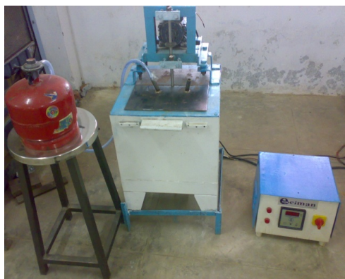
Fig. 1: Stir Casting Method

Composite preparation: Figure 1 two step stir casting route was adopted to fabricate the composites