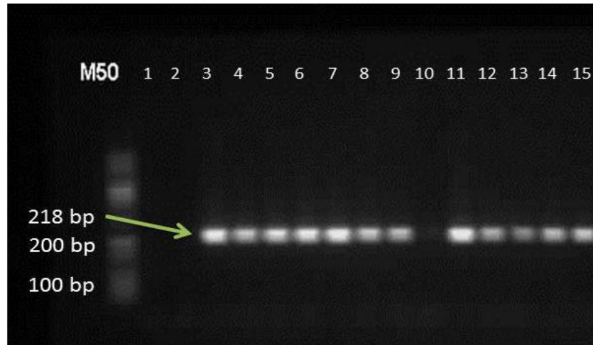
Fig. 2: Electrophoresis showing the results of Conventional PCR reaction. Line 1 and 15 are negative and positive control, respectively; Line 2 and 10 are negative (positive in microscopic methods); Line 3-9, 11-14 correspond to N. ceranae ; M-Molecular marker 50 bp