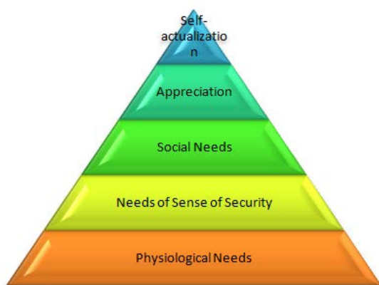
Fig. 1: Basic human needs

Motivation: Maslow shares the following human needs [8] :