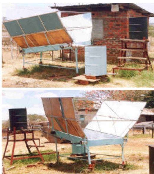
Fig.2: Photo of the prototype solar pasteurization system at Kenyatta University, Nairobi, Kenya

with the assistance of technicians. All materials used for construction were purchased locally at relatively low costs. A galvanized pipe heat exchanger was constructed.