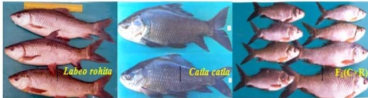
Fig. 2: The parental generations of backcrosses