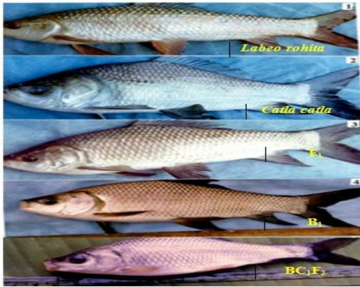
Fig. 1: Photographs of representative carps of different generations