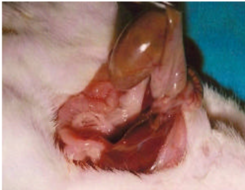
Fig. 5: Thick and large adhesion on the front and/or back parts of abdominal wall

Evaluation of outcomes was made using statistical methods of frequency and percentage. In both evaluation types, differences were analyzed using a \chi^2 -test.