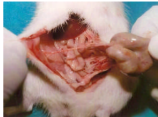
Fig. 2: Thin and local adhesion