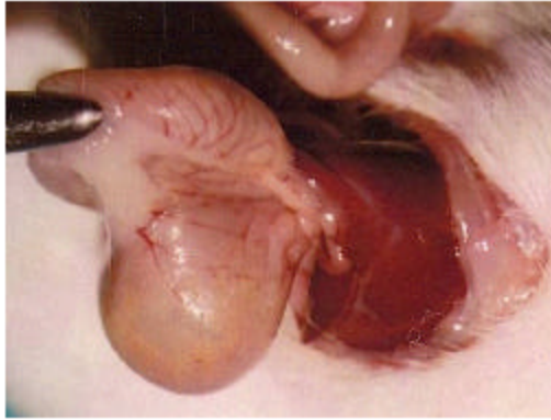
Fig. 4: Thick and on a larger scale