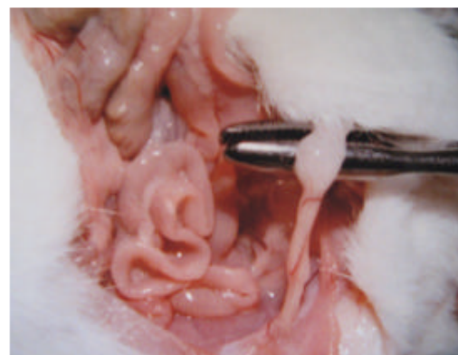
Fig. 3: Restricted adhesion