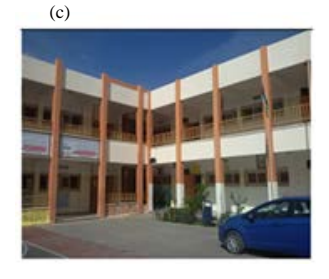
Fig. 6(a-c): Hamza bin Abi Talib school as a partial shelter for the displaced

Umm El-Nasr is exposed to the dangers of wars that cause overall displacement of the entire population because the village is in a location for military operations. There is also another danger that causes partial