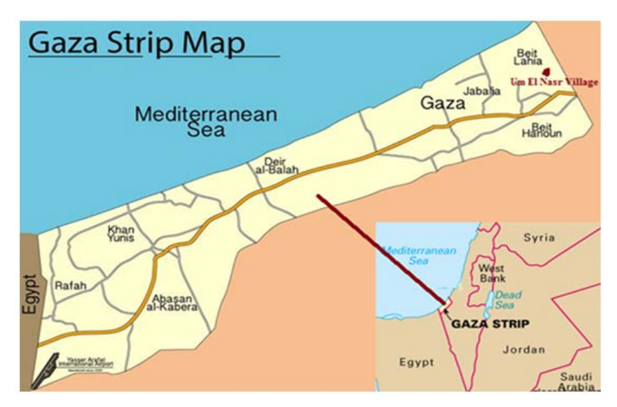
Fig. 2: General location of Umm Al-Nasr village