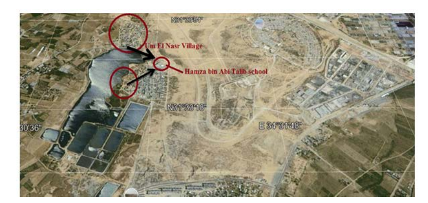
Fig. 4: Partial displacement to Hamza Bin Abi Talib school