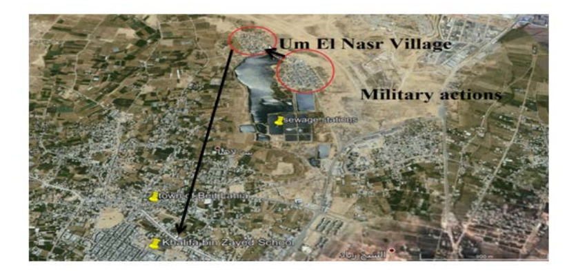
Fig. 5: Overall displacement operations to Khalifa Bin Zayed school