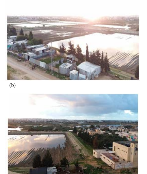
Fig. 3: Sewage basin