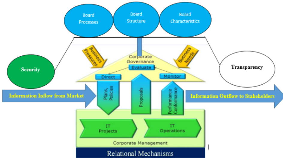
Fig. 1: Enterprise IT governance model