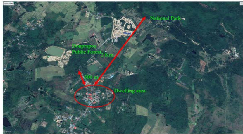
Fig. 1: Map of Loadern village and Donparpoa public forest (Google Earth, 2019)