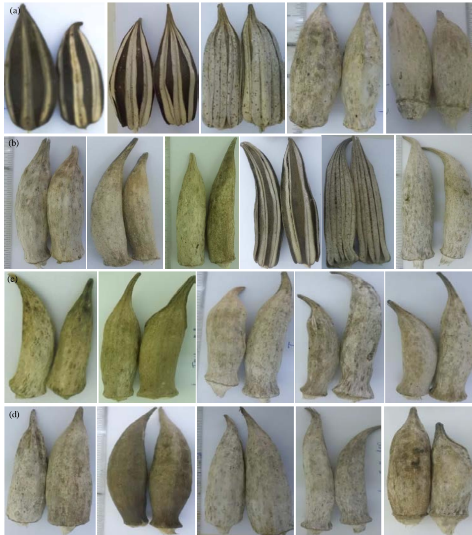
Fig. 2: Variation in dry fruits of accessions: a) DKA, Yeji-Local, asontem NV, labadi Cs-Legon; b) Mapelega cape, debo akrave, volta agric type 1; c) Kpeve' asontem-ERJuaboso, legon fingers asontem-BAR; d) Asante type 2, amanfrom agric short fruit asontem-ASR, Atomic

also in Table 1 and 2. Stems were generally erect and slightly branched with colour ranging from greenish through yellowish green to purplish which were glabrous or pubescent. The leaves exhibited typical maple to cordate shape with variation in number of lobes, pubescence, petiole colour and venation. Flower colour also varied from cream, yellow to purple. Fruits invariably exhibited pubescence (downy or rough) but varied in shape, size, colour, general conformation, as well as presence or absence of ridges (most prominent on the dry fruits). There was also variation among accessions with respect to maturity duration ranging from early, mid season, late to very late. These agree with results