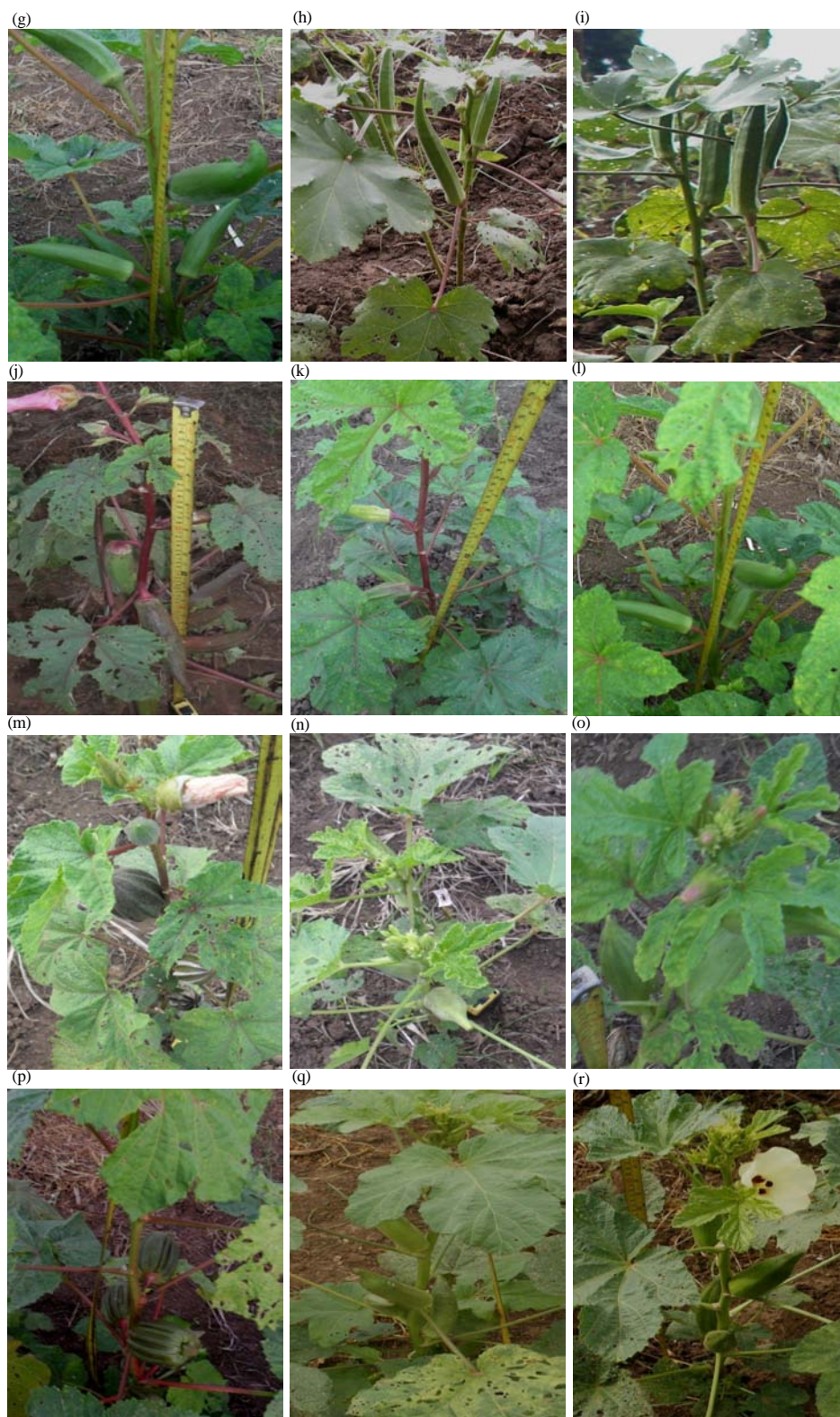
Fig. 1: Variation in vegetative and reproductive characteristics of accessions: a) Indiana; b) Mamolega; c) Cape; d) Labadi; e) Atomic; f) Debo; g) Agric short fruit; h) Volta; i) Kortebortor-ASR; j) DKA; k) Akrave; l) Amanfrom; m) Asontem nv; n) Asontem-ER; o) Mapelega; p) Yeji-Local; q) Agric type 1; r) Asante type 2