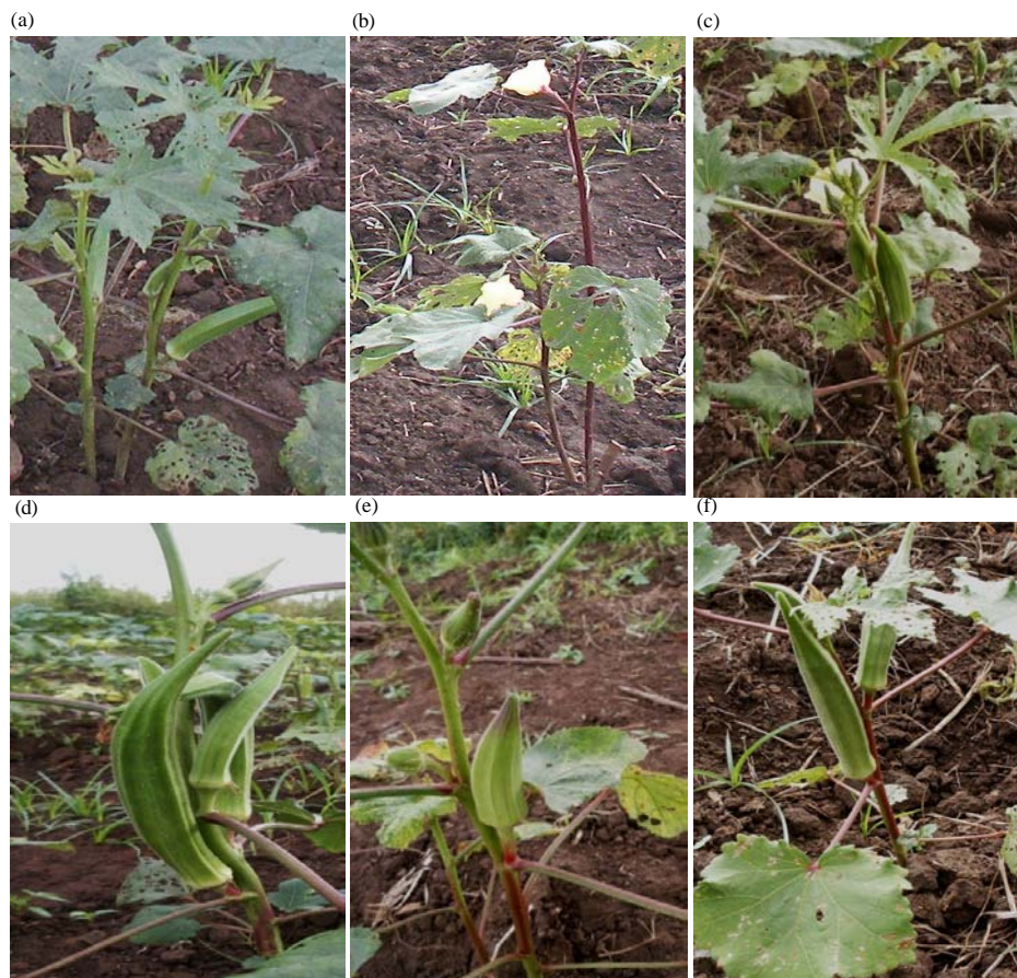
Fig. 1: Continue

The accessions varied extensively in vegetative and reproductive characteristics as shown in Fig. 1 and 2 and