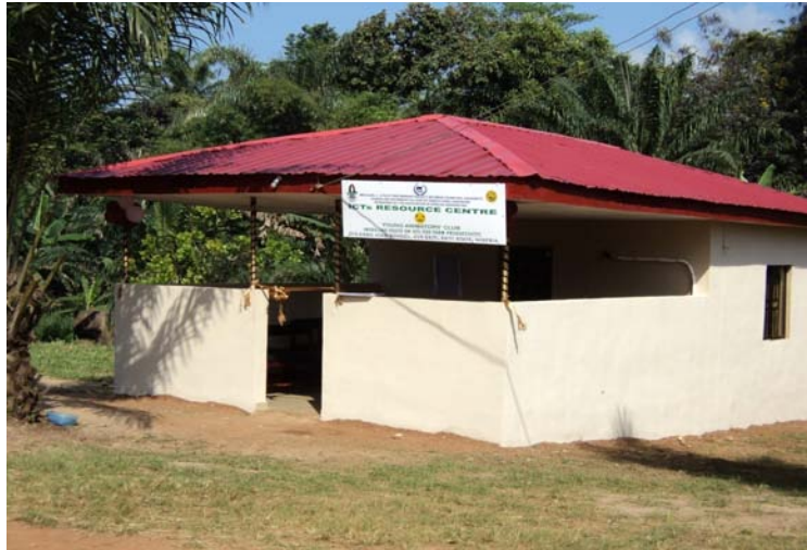
Fig. 2: The ICT resource center housing the accessories for the Animators' Club in Nigeria